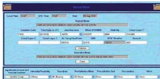
Manual / Auto Metar Input Screen

The Fugro HMS calculates final meteorological condition parameters based on standards and requirements given by the World Meteorological Organization (WMO) and the Norwegian Meteorological Institute (DNMI) regarding meteorological equipment for use at airports and landing areas for helicopters, both offshore and onshore.